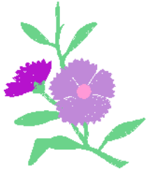
Asia106.pes 83.80x99.00 mm; 6,433 stitches 4 thread changes; 4 colors