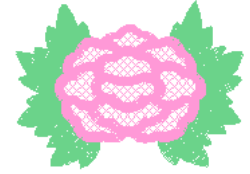
Asia105.pes 94.10x69.40 mm; 9,037 stitches 2 thread changes; 2 colors