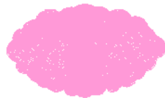
Asia117.pes 95.60x56.40 mm; 10,451 stitches 1 thread changes; 1 colors