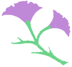
Asia101.pes 94.00x88.60 mm; 4,443 stitches 2 thread changes; 2 colors