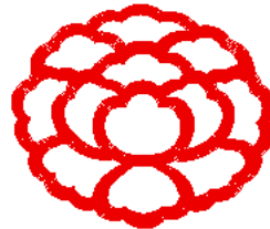
Asia113.pes 99.20x84.40 mm; 4,804 stitches 1 thread changes; 1 colors