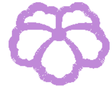
Asia115.pes 83.60x69.20 mm; 3,031 stitches 1 thread changes; 1 colors