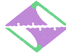
Asia104.pes 91.20x74.80 mm; 5,093 stitches 2 thread changes; 2 colors