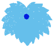
Asia111.pes 69.40x61.30 mm; 6,827 stitches 2 thread changes; 2 colors