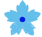
Asia110.pes 53.20x51.40 mm; 3,297 stitches 2 thread changes; 2 colors