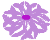
Asia112.pes 64.00x52.40 mm; 4,080 stitches 2 thread changes; 2 colors