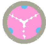
Asia107.pes 58.80x58.80 mm; 7,062 stitches 3 thread changes; 3 colors