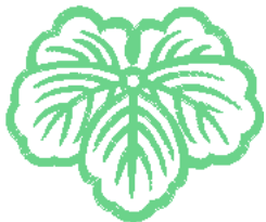
Asia116.pes 99.00x82.80 mm; 5,453 stitches 1 thread changes; 1 colors