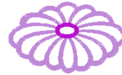
Asia114.pes 97.20x58.40 mm; 4,163 stitches 2 thread changes; 2 colors