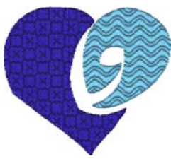
Hrt016.pes 73.80x66.20 mm; 6,841 stitches 2 thread changes; 2 colors