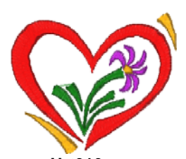
Hrt010.pes 72.90x61.80 mm; 2,807 stitches 4 thread changes; 4 colors