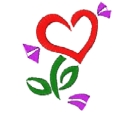
Hrt020.pes 58.00x72.80 mm; 1,810 stitches 3 thread changes; 3 colors