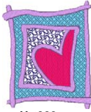
Hrt009.pes 84.60x95.60 mm; 15,910 stitches 4 thread changes; 4 colors