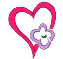
Hrt012.pes 57.00x67.40 mm; 1,685 stitches 3 thread changes; 3 colors