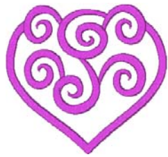
Hrt002.pes 90.40x84.00 mm; 4,944 stitches 1 thread changes; 1 colors