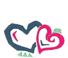
Hrt005.pes 81.60x48.80 mm; 2,383 stitches 3 thread changes; 3 colors