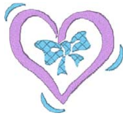
Hrt003.pes 80.00x73.60 mm; 3,384 stitches 2 thread changes; 2 colors