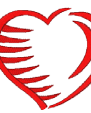
Hrt019.pes 93.00x81.20 mm; 4,710 stitches 1 thread changes; 1 colors