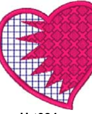
Hrt024.pes 71.40x70.80 mm; 6,971 stitches 2 thread changes; 2 colors