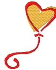
Hrt004.pes 74.40x93.60 mm; 2,079 stitches 2 thread changes; 2 colors