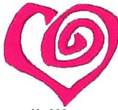
Hrt008.pes 51.40x46.60 mm; 1,683 stitches 1 thread changes; 1 colors