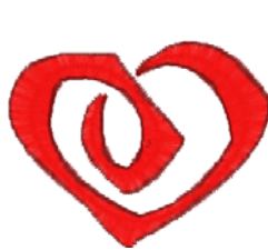
Hrt013.pes 44.00x34.80 mm; 1,027 stitches 1 thread changes; 1 colors