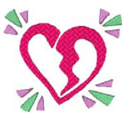
Hrt017.pes 96.60x83.80 mm; 6,672 stitches 3 thread changes; 3 colors