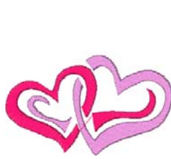
Hrt018.pes 83.80x50.60 mm; 2,214 stitches 2 thread changes; 2 colors