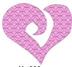
Hrt022.pes 83.40x73.60 mm; 7,346 stitches 1 thread changes; 1 colors