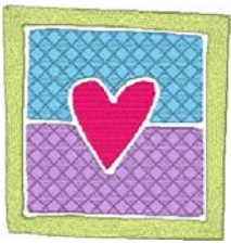
Hrt001.pes 79.80x82.80 mm; 13,210 stitches 4 thread changes; 4 colors