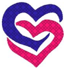
Hrt011.pes 80.80x87.00 mm; 8,643 stitches 2 thread changes; 2 colors