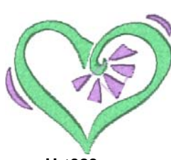
Hrt023.pes 59.00x49.40 mm; 1,713 stitches 2 thread changes; 2 colors