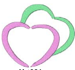
Hrt021.pes 83.40x72.40 mm; 1,819 stitches 2 thread changes; 2 colors