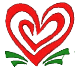
Hrt015.pes 51.20x47.60 mm; 1,962 stitches 2 thread changes; 2 colors