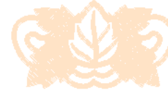
Ww06.pes 98.60x53.40 mm; 5,908 stitches 1 thread changes; 1 colors