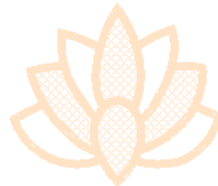
Ww08.pes 99.20x85.40 mm; 5,774 stitches 1 thread changes; 1 colors