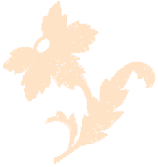
Ww01.pes 92.20x99.00 mm; 5,199 stitches 1 thread changes; 1 colors