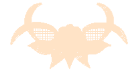
Ww09.pes 97.60x55.00 mm; 4,166 stitches 1 thread changes; 1 colors