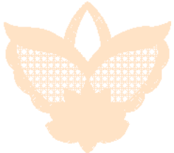
Ww10.pes 98.50x90.40 mm; 10,173 stitches 1 thread changes; 1 colors