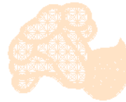
Ww05a.pes 72.80x58.60 mm; 5,360 stitches 1 thread changes; 1 colors