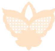
Ww10a.pes 73.80x68.10 mm; 6,298 stitches 1 thread changes; 1 colors