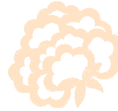
Ww04.pes 98.60x91.60 mm; 5,763 stitches 1 thread changes; 1 colors