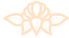
Ww03.pes 99.00x52.90 mm; 3,160 stitches 1 thread changes; 1 colors