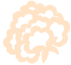
Ww04b.pes 55.60x51.80 mm; 2,915 stitches 1 thread changes; 1 colors