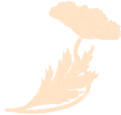
Ww02.pes 97.60x94.20 mm; 5,603 stitches 1 thread changes; 1 colors