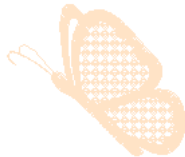
Ww07a.pes 74.10x63.60 mm; 3,002 stitches 1 thread changes; 1 colors