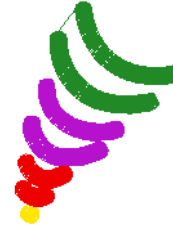
Z202lg.pes 2.79x3.73 inches; 2,232 stitches 4 thread changes; 4 colors