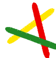
Z212lg.pes 2.91x3.01 inches; 1,804 stitches 3 thread changes; 3 colors