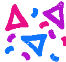
Z230lg.pes 3.53x3.35 inches; 3,077 stitches 3 thread changes; 3 colors