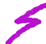
Z216lg.pes 2.31x2.24 inches; 1,018 stitches 1 thread changes; 1 colors