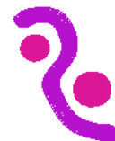
Z208lg.pes 1.98x2.50 inches; 1,717 stitches 2 thread changes; 2 colors