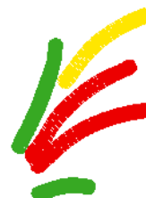
Z220lg.pes 2.67x3.58 inches; 2,142 stitches 3 thread changes; 3 colors