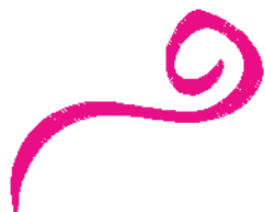
Z223lg.pes 3.84x3.11 inches; 1,402 stitches 1 thread changes; 1 colors