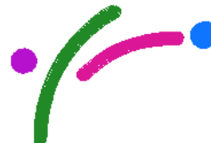
Z210lg.pes 3.91x2.61 inches; 1,654 stitches 4 thread changes; 4 colors