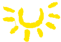
Z229lg.pes 3.15x2.21 inches; 1,439 stitches 1 thread changes; 1 colors