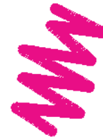
Z228lg.pes 2.37x3.20 inches; 2,589 stitches 1 thread changes; 1 colors