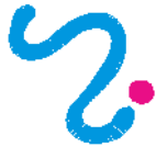
Z225lg.pes 2.20x2.11 inches; 1,254 stitches 2 thread changes; 2 colors