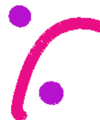
Z218lg.pes 2.28x2.79 inches; 1,475 stitches 2 thread changes; 2 colors