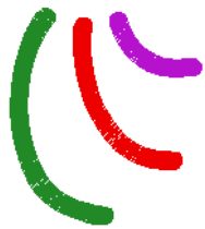
Z209lg.pes 2.93x3.34 inches; 1,725 stitches 3 thread changes; 3 colors