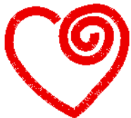
Z207lg.pes 2.95x2.72 inches; 2,255 stitches 1 thread changes; 1 colors