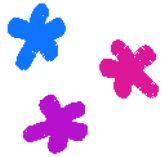
Z201lg.pes 2.51x2.50 inches; 1,743 stitches 3 thread changes; 3 colors