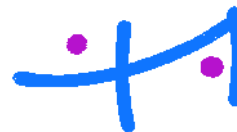
Z206lg.pes 3.87x2.11 inches; 1,698 stitches 2 thread changes; 2 colors