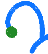
Z204lg.pes 2.63x3.09 inches; 1,737 stitches 2 thread changes; 2 colors