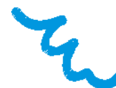
Z214lg.pes 2.71x2.00 inches; 994 stitches 1 thread changes; 1 colors