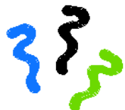
Z217lg.pes 2.72x2.50 inches; 1,470 stitches 3 thread changes; 3 colors